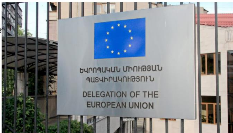
Delegation of the European Union in Erevan, Armenia. 05.09.2018.