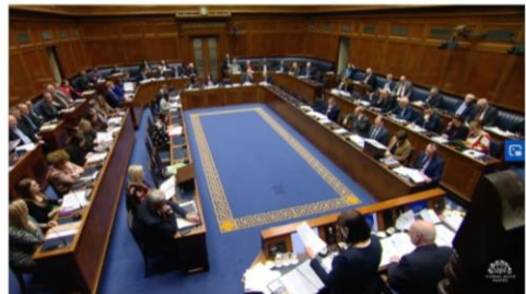
The Northern Ireland Assembly pictured during a vote on the Withdrawal Agreement in January 2020. The Assembly's first vote on the Protocol will take place in 2024.