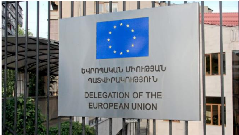
Delegation of the European Union in Erevan, Armenia. 05.09.2018.