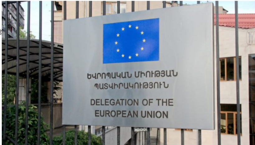
Delegation of the European Union in Erevan, Armenia. 05.09.2018.