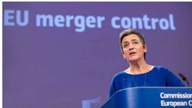
EU competition commissioner Margrethe Vestager

THE European Commission (EC) announced on February 6 that it has blocked the merger of Siemens Mobility and Alstom on the grounds that the two companies have failed to address its concerns over the potential impact of the deal on competition in the signalling and high-speed rolling stock markets.