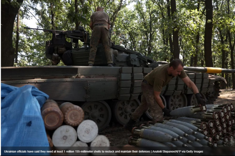
Ukrainian officials have said they need at least 1 million 155-millimeter shells to restock and maintain their defenses

The deal represents a landmark moment for the EU, which will be empowered to help negotiate arms contracts for the first time.