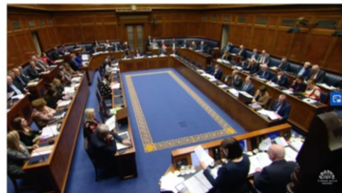
The Northern Ireland Assembly pictured during a vote on the Withdrawal Agreement in January 2020. The Assembly's first vote on the Protocol will take place in 2024.